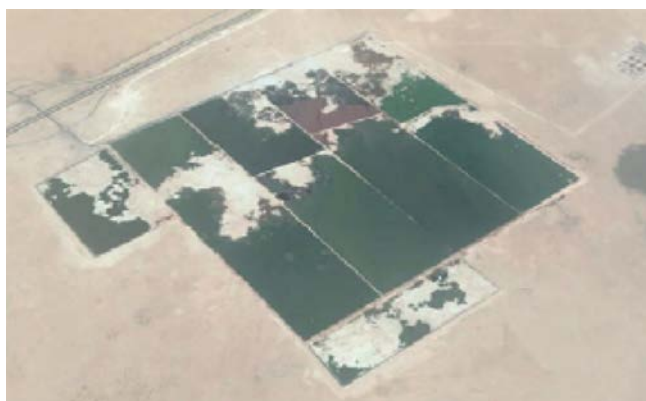
Aerial Photo of Al Karaana lagoons prior to remediation