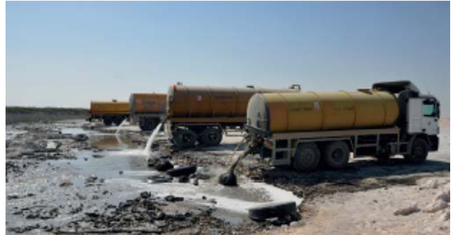
Tankers discharging wastewater into lagoons

The project was a great success and the remediation works were completed under time and under budget. Part of the success is due to the use of RemScan which provided instantaneous feedback of hydrocarbon concentrations.