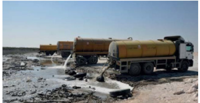
Tankers discharging wastewater into lagoons

The project was a great success and the remediation works were completed under time and under budget. Part of the success is due to the use of RemScan which provided instantaneous feedback of hydrocarbon concentrations.