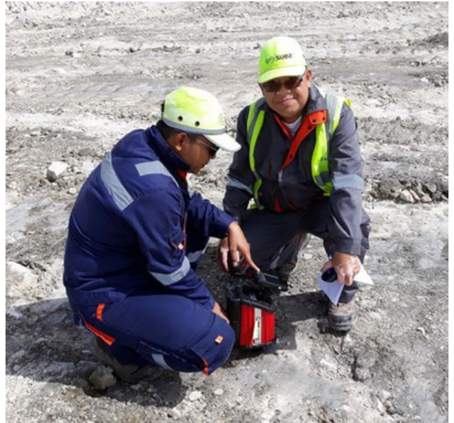
RemScan being used in-situ

The lagoons contained areas of significant hydrocarbon contamination which required specific remediation. To aid with this, SUEZ purchased two RemScans to measure the concentration of hydrocarbons in the soil.