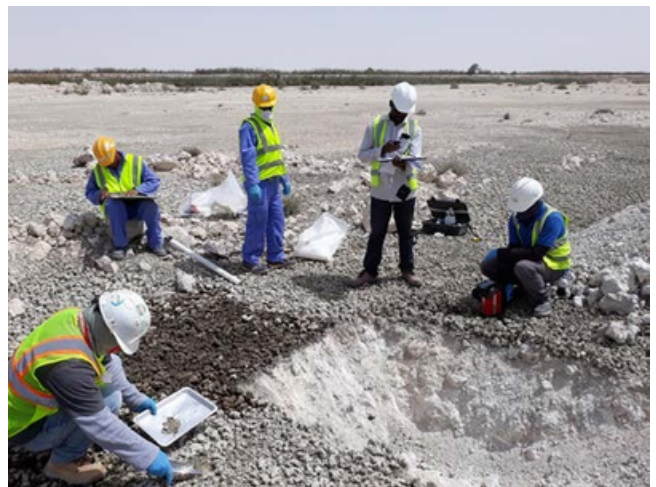
SUEZ monitoring TPH in-situ

“The RemScan instrument has proven to be a vital tool to carry out all internal and contractual in-situ analysis with the Client and Consultant. RemScan is very easy to use and gives immediate results, yet it remains a sensitive tool. As for laboratory analysis, the sample preparation, infield or in lab, is an important stage to ensure the reliability and repeatability of the measurements. SUEZ greatly appreciates the support from Ziltek, at all stages of the project, whether remote or on-site”.