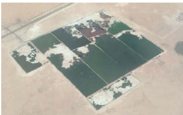
Aerial Photo of Al Karaana lagoons prior to remediation