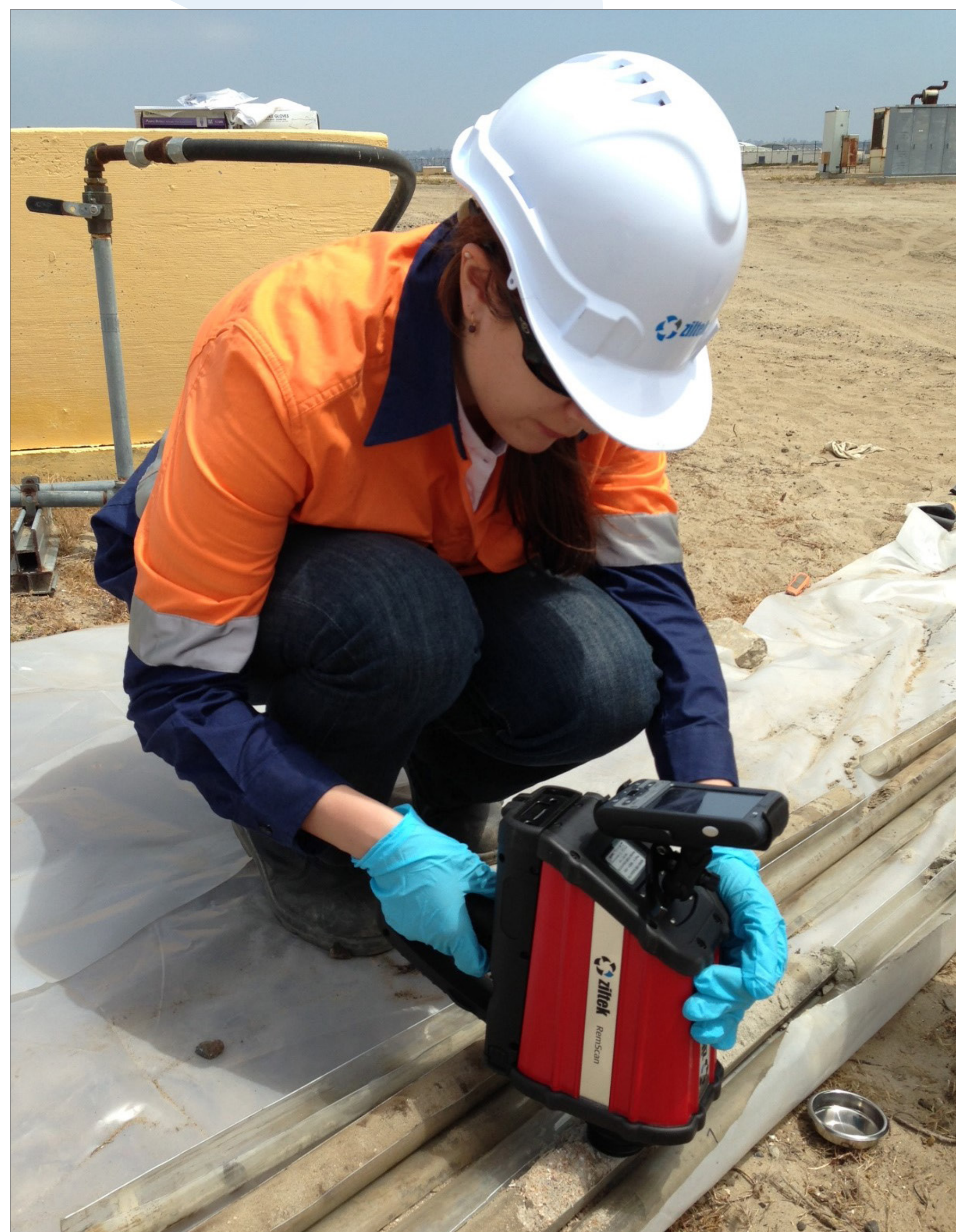
Figure 1: Using RemScan as a screening tool at Site 2.

#Adjusted to compensate for volatilization effects