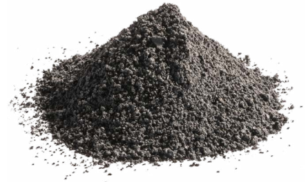
RemBind Plus 100