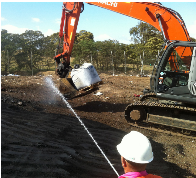
Adding RemBind to form the base of the burial pit

In this study, RemBind was used to reduce PFAS leachability in the soil to allow for safe disposal to landfill with regulatory approval.