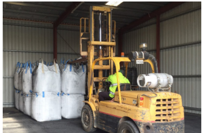
RemBind bulky bags being loaded