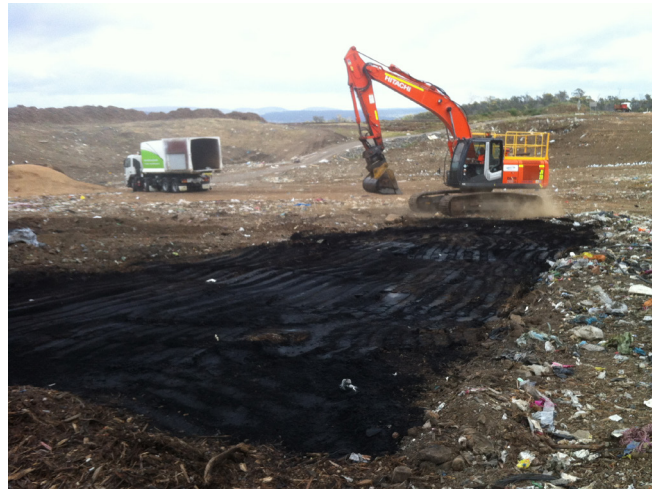
The finished RemBind cap on the burial pit

This is the first PFAS soil disposal project of this scale (1,000 tonnes) completed in Australia with EPA regulatory sign-off. This paves the way for the use of RemBind as a rapid, easy and cost-effective remediation strategy for mitigating the impact of PFAS contaminated soil on the environment. With proven long-term stability in a landfill situation, it also opens up the future possibility of re-using immobilized soil on site.